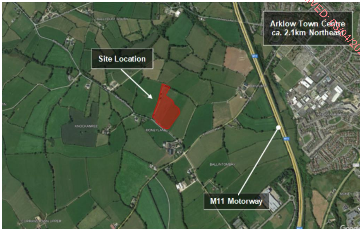
Figure 1.1: Proposed Development Site Location

The total site area measures ca. 4.02ha. The site is currently used as agricultural pastureland and bounded to the north, south, east, and west by further agricultural pastureland. An operational dairy farm is located ca. 100m to the southeast.